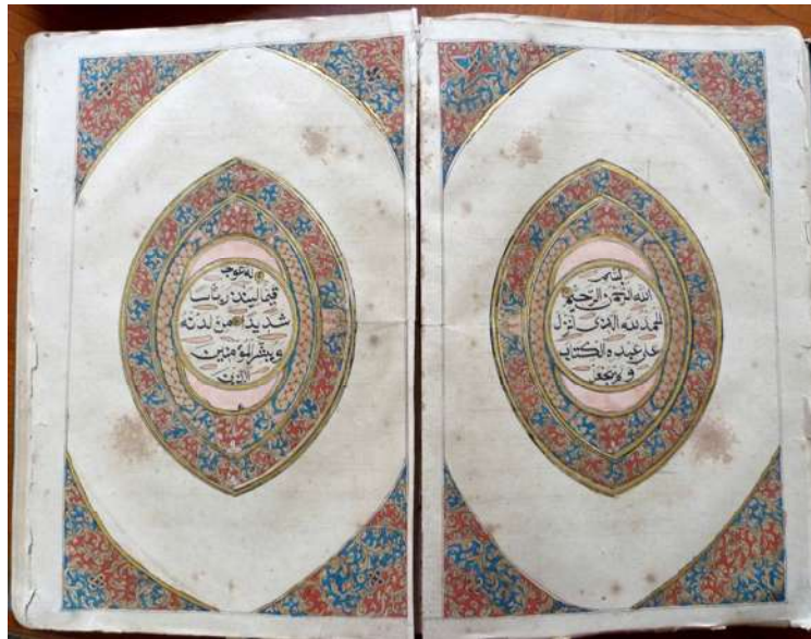
Fig.1. Decorated frames marking the beginning of Surat al-Kahf , with decorative coloured slivers between the lines of text that reflect Indo-Persian or Ottoman influence. This feature, and the unusual almond-shaped illuminated frames, are indicative of the Javanese origin of this Qur'an manuscript, ca.19th c. BQ&MI