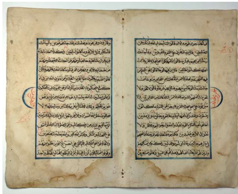
Fig.4. Symmetrical semicircular juz' markers on two facing pages, and two decorative marginal red-ink inscriptions of 'ayn, in a Javanese Qur'an which has been disbound and offered for sale on e-Bay in separate bifolia of four pages each.

< http://www.ebay.com/itm/12-PAGES-ANTIQUA-MALAY-JAWI-ARABIC-ISLAMIC-QURAN-KORAN-MANUSCRIPT-LEAF-16TH-/281018653571?pt=Antiquarian_Collectible&hash=item416e045b83#ht_523wt_721 >; consulted 29.11.2012.