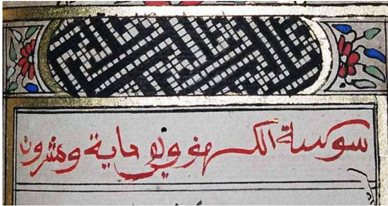
Fig. 3. Detail of a decorated panel with the banji (swastika) motif, from an illuminated Qur'an from Java. Islamic Arts Museum Malaysia, 2004.2.3.